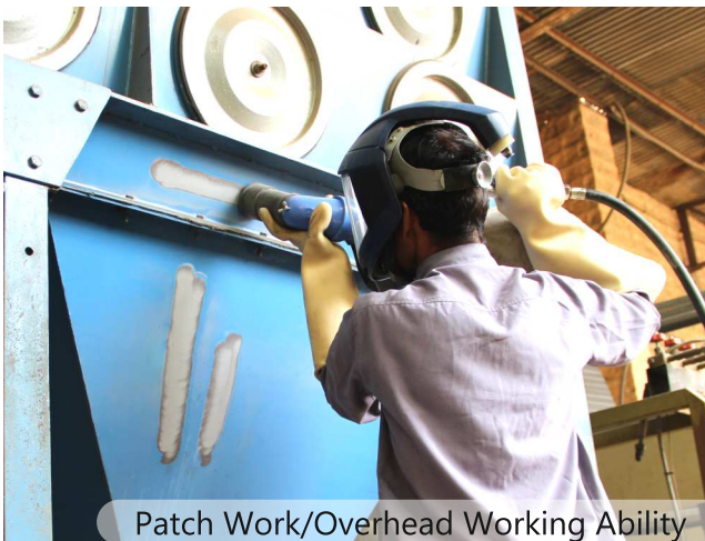
Patch Work/Overhead Working Ability