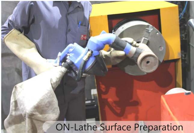
ON-Lathe Surface Preparation

Vacuum pickup eliminates dust.. Recovers abrasive for re-use Blast clean machinery areas, plant floors, etc. without dust problem.